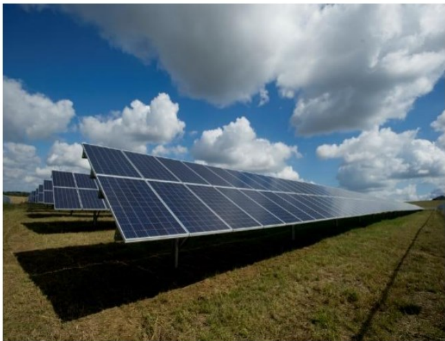
Figure 2: Example of fixed tilt panel orientation

The panels are to be fixed-tilt south-oriented in order to maximize power generation. According to the Applicant, the sizing of the plant has been based on twenty (20) years of solar irradiation data from SolarGIS, an internationally acclaimed consultancy.